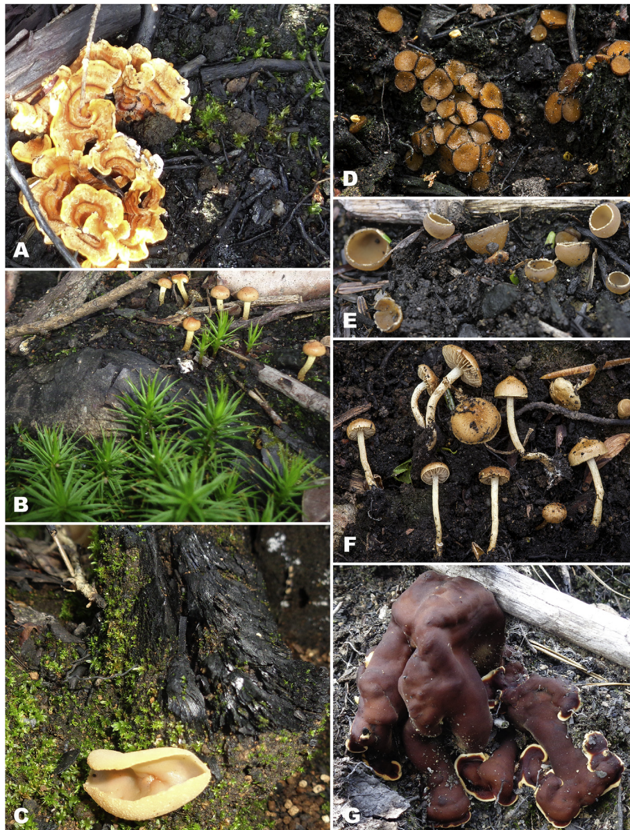
Fig. 2. Mosses and fungi growing on burned soil or wood after a fire in the Great Smoky Mountains National Park. A-C. Various species of mosses and pyrophilous fungi growing together after a severe burn. D. Anthracobia melaloma . E. Geopyxis carbonaria . F. Pholiota highlandensis . G. Rhizina undulata .

Arizona and Umbilicaria proboscidea from Alaska (U'Ren et al., 2012). In our study, G. carbonaria was found from two bryophyte samples, Clinclidium sp. from Alaska and Leucobryum sp. from the GSMNP unburned area, which reinforces the conclusion that G. carbonaria is a widespread endophyte and endolichenic fungus that then produces apothecia exclusively in post-fire environments.